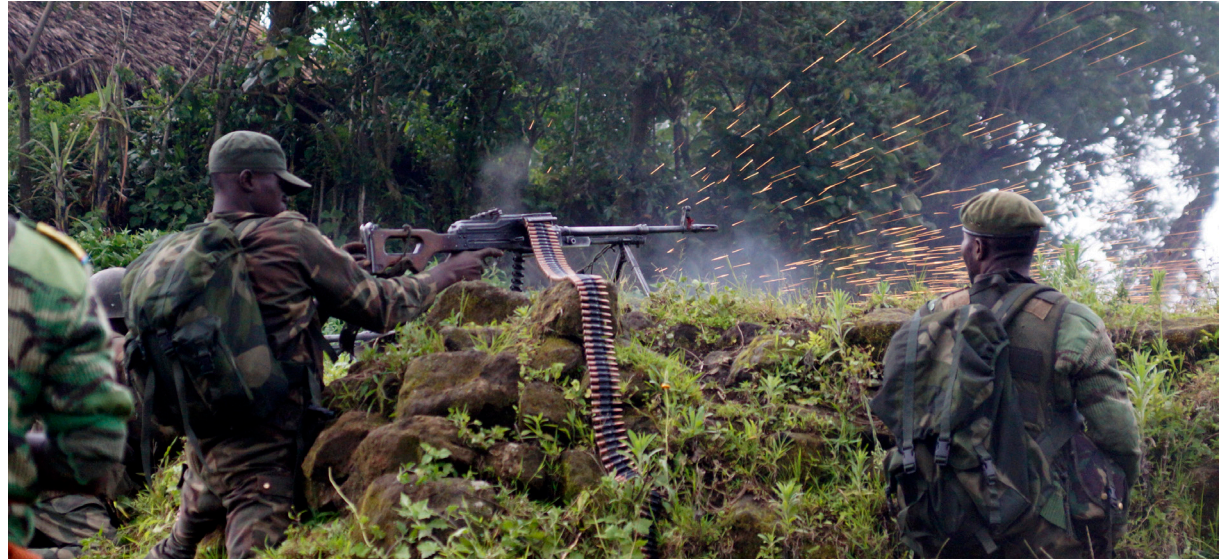
Congolese soldier shoots in the direction of M23 rebels from their position near the Rumangabo military base in Runyoni, 58 km (36 miles) north of Goma, October 31, 2013.

assessment that draws on the informed judgment of the experts polled. Similarly, what constitutes a threat to the “national interest” also rests on respondents’ personal calculations since there are no objective or widely accepted criteria for making such assessments.