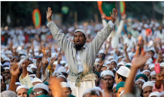
Activists of Islami Shashontontro Andolon , a radical Islamist party, shout slogans during a protest rally in Dhaka, Bangladesh, November 8, 2013.

The Preventive Priorities Survey seeks to help policymakers choose among competing conflict prevention demands by offering what is essentially a risk assessment of the United States' geopolitical environment over the next twelve months. Risk in this context is defined as the product of the perceived likelihood of a conflict erupting or escalating and the potential impact it could have on U.S. interests. Given the inherent uncertainties surrounding the onset and escalation of violent conflict, precise predictions are simply not possible. The PPS, therefore, is a qualitative