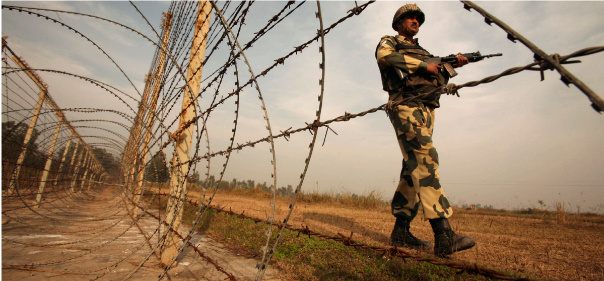
An Indian Border Security Force (BSF) soldier patrols near the fenced border with Pakistan in Suchetgarh, southwest of Jammu, January 14, 2013.