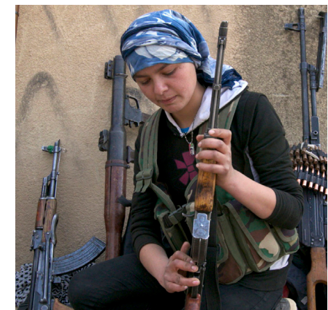
Left: Riot police and army personnel take their positions during clashes with members of the Muslim Brotherhood and supporters of ousted Egyptian president Mohammed Morsi in the area of Rabaa Adawiya Square, where they are camping in Cairo, August 14, 2013. Right: A Kurdish female fighter from Kurdish People's Protection Units (YPG) checks her weapon near Ras al-Ain, in the province of Hasakah, after capturing it from Islamist rebels, November 6, 2013.